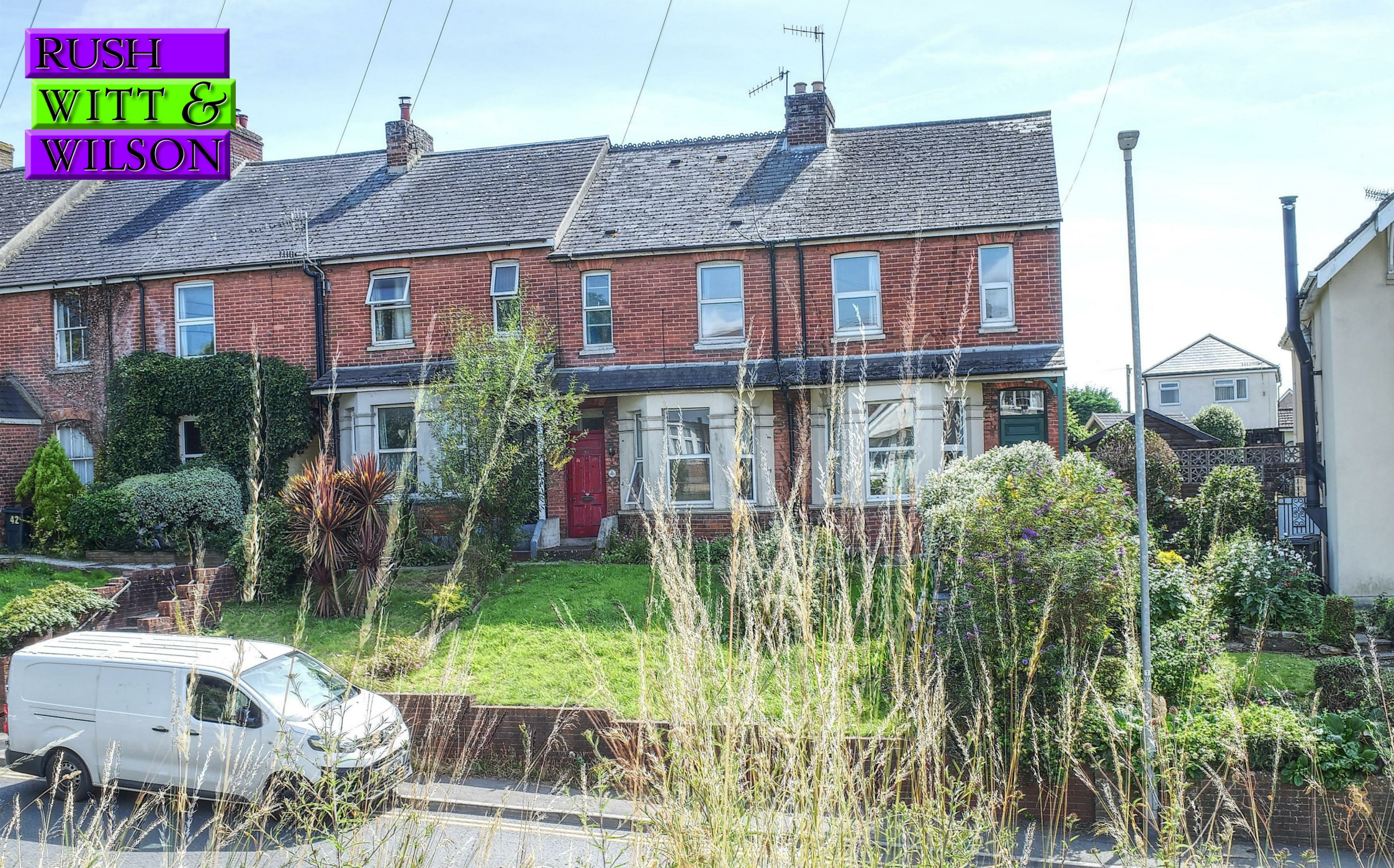
36 Wrestwood Road, Bexhill-On-Sea, East Sussex TN40 2LL £262,500